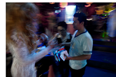
Figure 4: YGD outreach worker in the street near clubs in Kuta