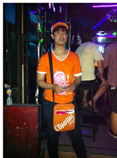
Figure 1: YGD outreach worker in Condom Man uniform

Bali as a tourist destination has attractions for foreign or domestic MSM and transgenders. Research conducted by LaTrobe University, Australia, for the Indonesian National AIDS Commission (2012) showed that five bars in the tourist area of Seminyak were the most frequently visited, including by MSM sex workers. Large numbers of Indonesian MSM arrive in Bali with minimal information about HIV. The Gaya Dewata Foundation (YGD) an organization for MSM/Transgenders in Bali, developed the CondomMan initiative to provide intensive information to MSM in these bars and to improve access to condoms and lubricant as well as VCT referrals.