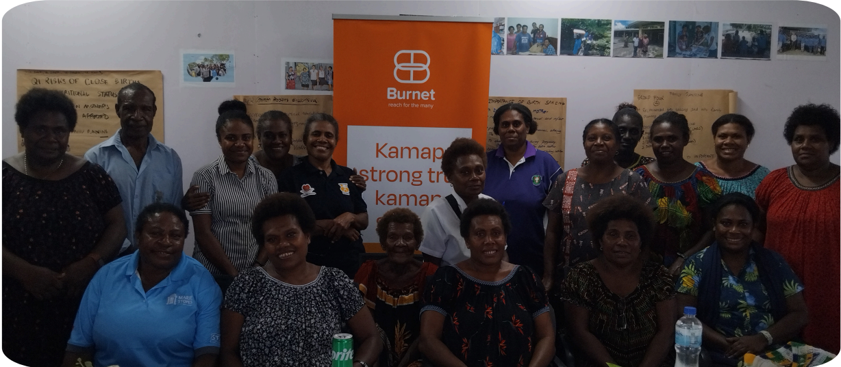
Photo below: Group photo of all the participants from the workshop