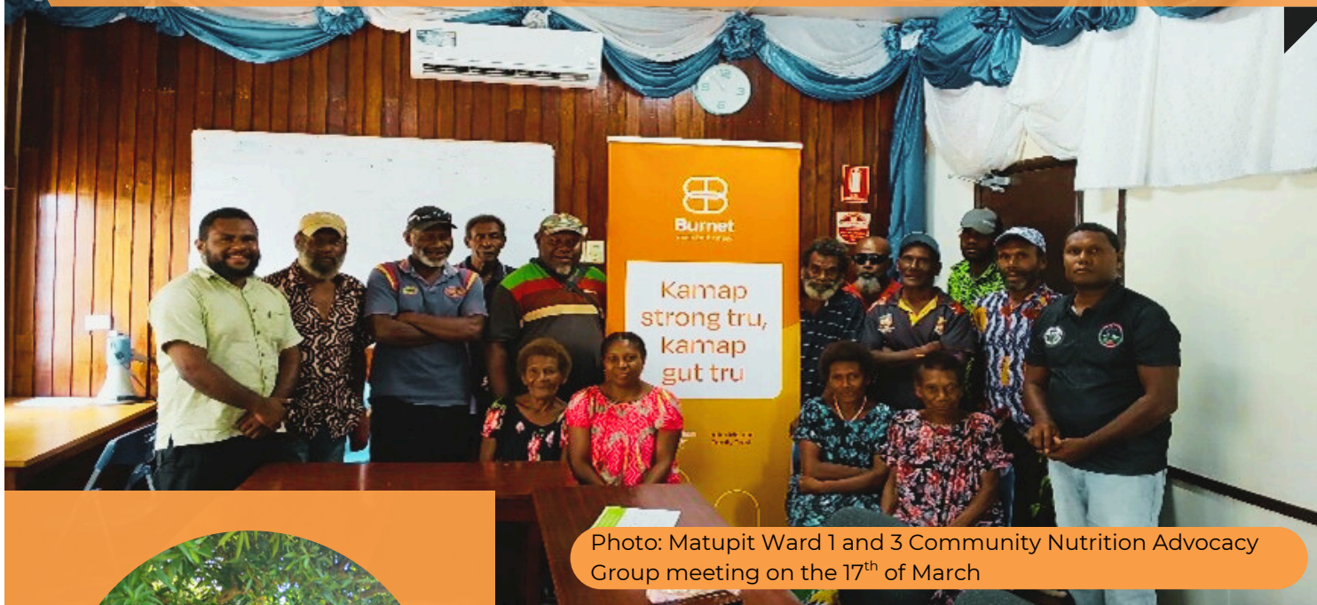
Photo: Matupit Ward 1 and 3 Community Nutrition Advocacy Group meeting on the 17 th of March