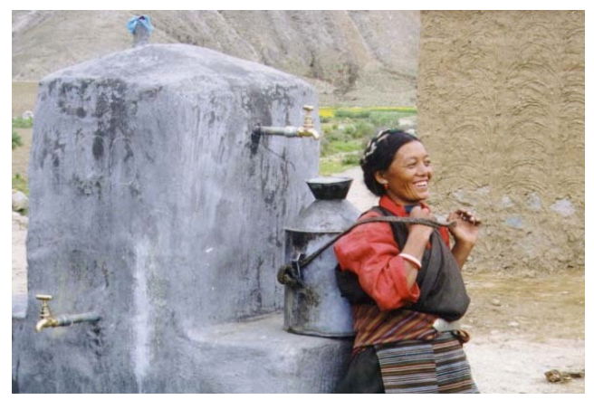
Back-happy tap stand, Burnet Institute

Examples of potential adverse effects for elders